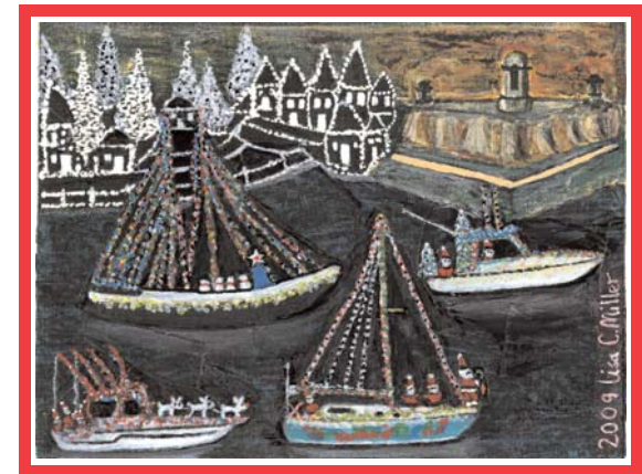
Regatta of Lights Winners

6:00 PM Saturday, December 11, 2010 Matanzas Bay